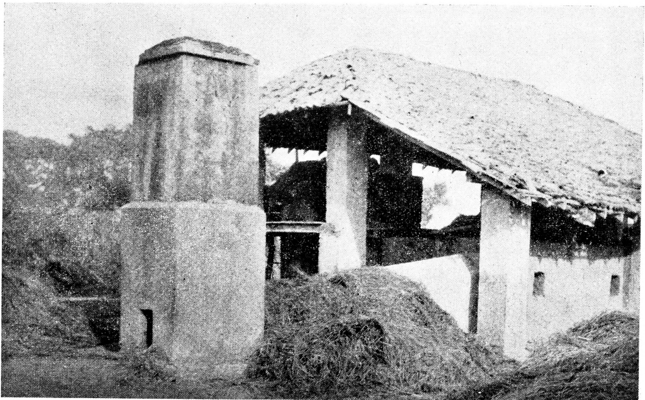
Citronella Oil Distillery.