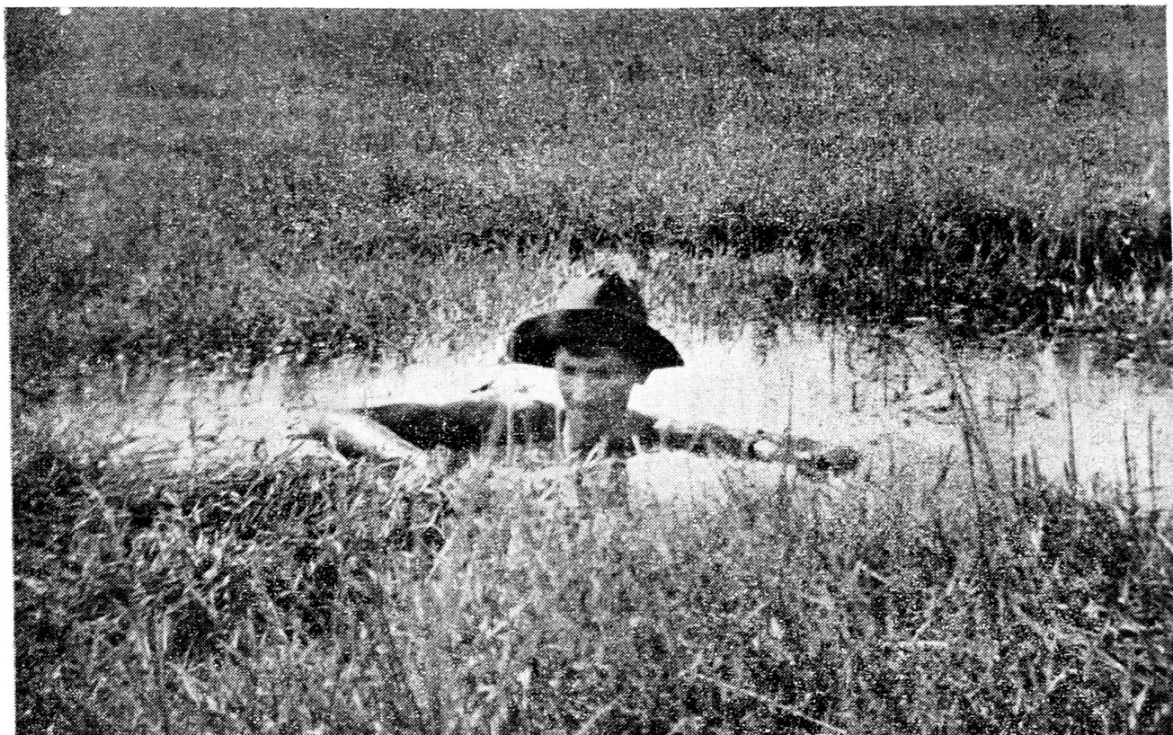
Swampy Paddy Fields characteristic of the Galle and Matara Districts.