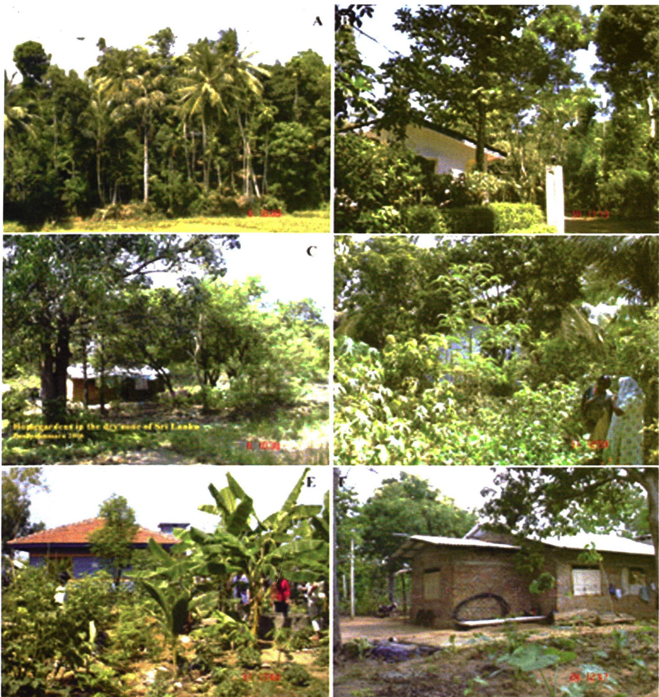
Plate 1. Different developmental stages of homegardens in Sri Lanka.

Note: A=Well managed Kandyan homegarden can provide a similar environmental services as natural forests with well-stocked, multi-strata species of jackfruit, coconut, arecanut, kitul, ginisapu etc., although garden owned by individuals as neighboring gardens blend together an area seen from above appears as a forest island; B=Well managed Kandyan homegardens is useful to maintain a pleasant environment around the house; C=Dry zone homegardens are structurally simpler than that to Wet zone homegardens; D and E=Well stocked homegarden with annuals (many vegetables) and perennials (kathurumurunga, coconut, mango, banana etc.) can support family food and nutritional security; F=Early stage of development of homegarden.