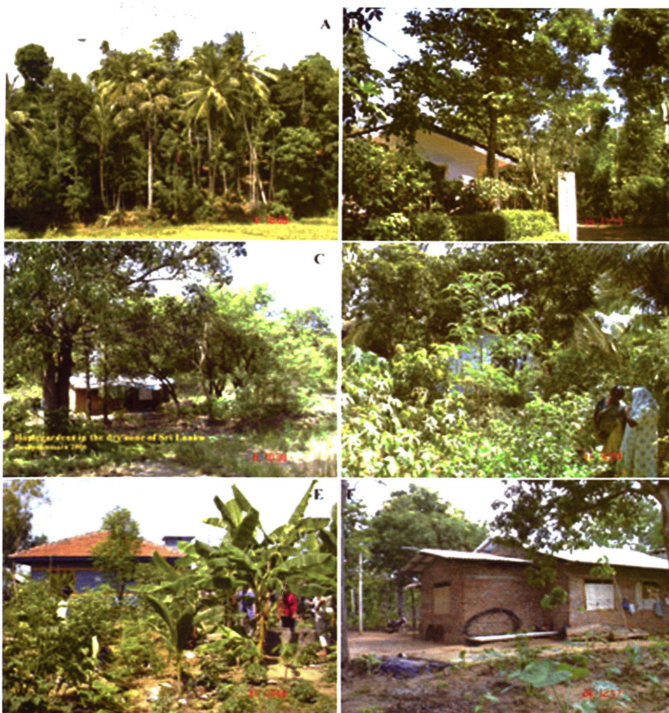
Plate 1. Different developmental stages of homegardens in Sri Lanka.

Note: A=Well managed Kandyan homegarden can provide a similar environmental services as natural forests with well-stocked, multi-strata species of jackfruit, coconut, arecanut, kitul, ginisapu etc., although garden owned by individuals as neighboring gardens blend together an area seen from above appears as a forest island; B=Well managed Kandyan homegardens is useful to maintain a pleasant environment around the house; C=Dry zone homegardens are structurally simpler than that to Wet zone homegardens; D and E=Well stocked homegarden with annuals (many vegetables) and perennials (kathurumurunga, coconut, mango, banana etc.) can support family food and nutritional security; F=Early stage of development of homegarden.