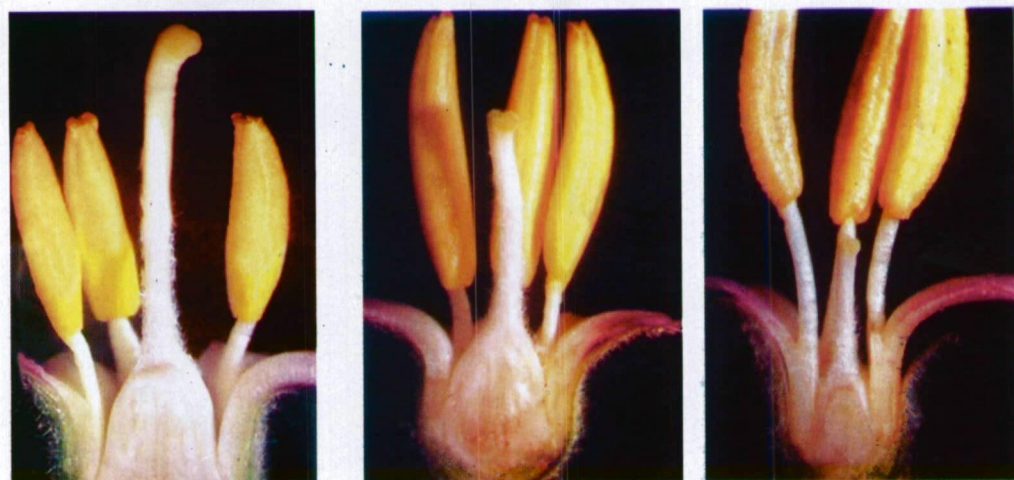
Figure 2. Longitudanal sections of three flower types (sterio microscopic view)