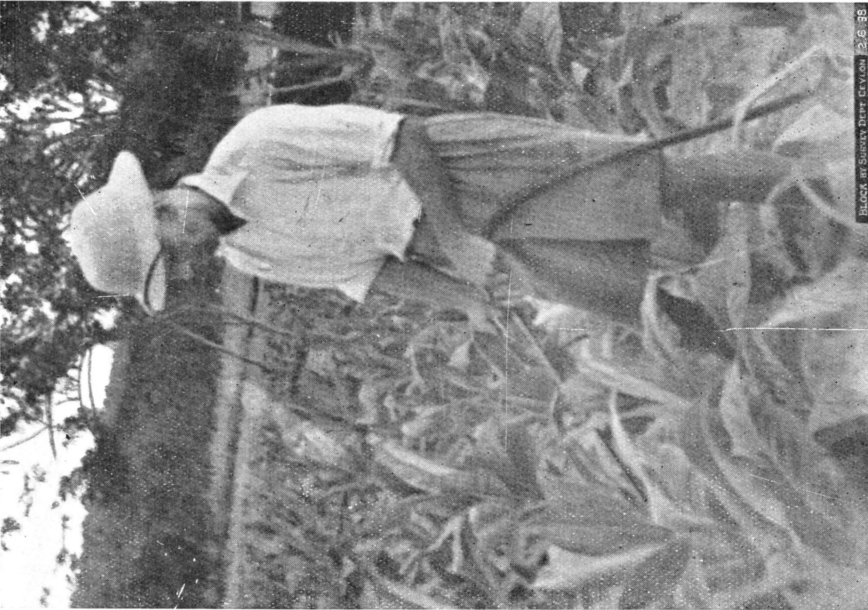
Block, by Survey Dept. Cayman, 2.6-39